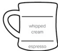
Café Con Panna