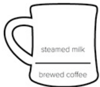
Café Au Lait