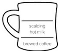
Café Con Leche